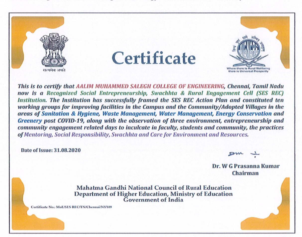
Figure: Certificate for Recognized Social Entrepreneurship, Swachhta & Rural Engagement cell Institution from MGNCRE, DHE, Ministry of Education, Govt. of India.

Institute has participated at national level as Recognized SES REC (Social Entrepreneurship, Swachhta & Rural Engagement Cell) Institution, Mahatma Gandhi National Council of Rural Education, Department of Higher Education, Ministry of Human Resource Development, Govt. of India for improving the facilities in the campus and community in the areas of Sanitation & Hygiene, Waste Management, Water Management, Energy Conservation and Greenery.